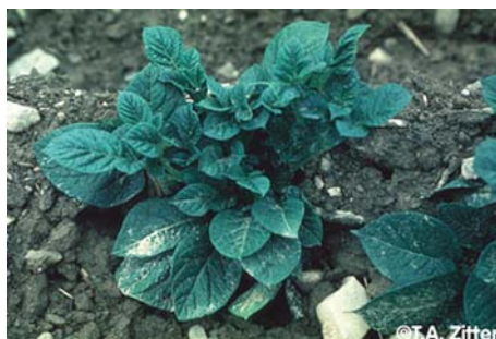
FIGURE 1. Foliar infection of potato spindle tuber viroid (PSTVd) showing stiff upright growth habit.