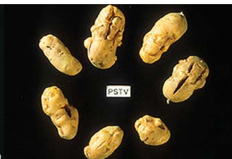
FIGURE 3. Tuber infection of potato spindle tuber viroid (PSTVd) showing cracked tubers.